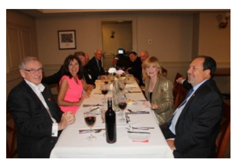
Happy Guests at the Annual General Meeting Dinner