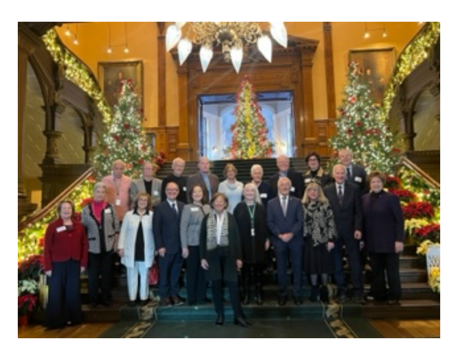
Attendees of the Luncheon

On November 30, 2023 the Association sponsored a stimulating and well attended Outstanding Legislator Award 2023 luncheon to honour three (3) distinguished former MPPs.