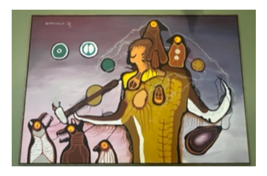
Tobacco Ceremony, 1975, by Blake Debassige of the M'Chigeeng First Nation. Room 228, Ontario Legislative Building, where the luncheon was held.