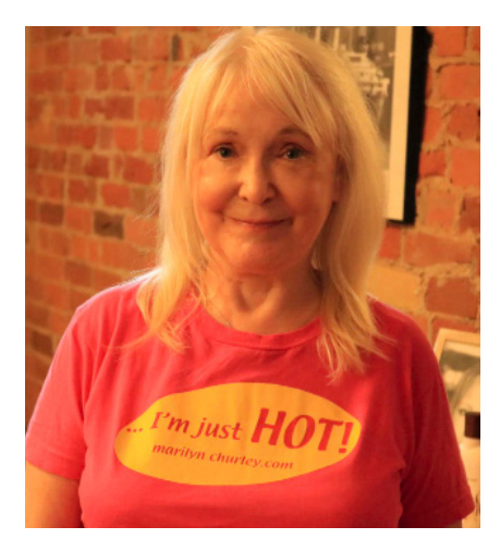
I'm just Hot! T-shirt

working in other public positions i.e., journalists) are routinely objectified and threatened with sexual violence. But we must push back when the opportunity presents itself.