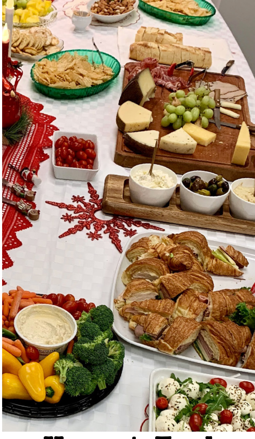
Up next: Food