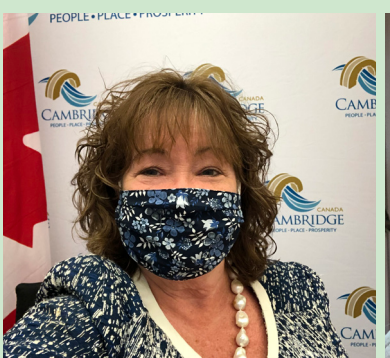
Kathryn McGarry Mayor of Cambridge