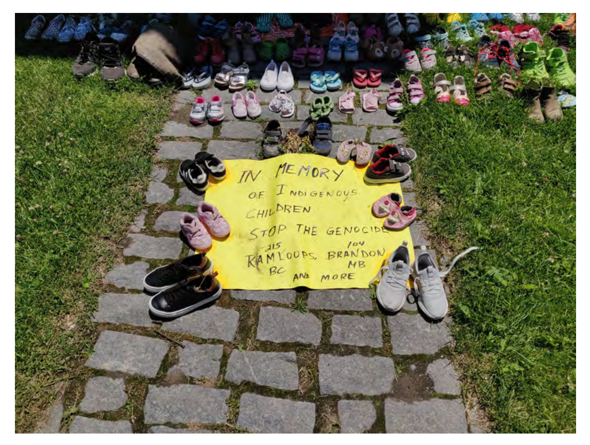
A SOLIDARITY OF SPIRIT, REMEMBERING THE 215 UNMARKED GRAVES AT A RESIDENTIAL SCHOOL, KAMLOOPS, B. C. AND MANY OTHERS.

Sadly, racism has been an aspect of life in Canada for more than 200 years. The pandemic seems to have triggered more public displays and violence directed against non-whites. Those of Asian descent blamed for the virus. So too, hatred, based on religious beliefs. There is no shortage of examples of violence and threats of violence