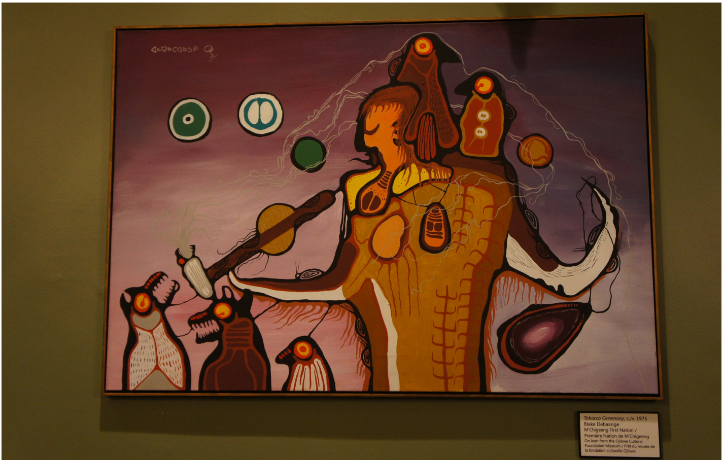
Tobacco Ceremony, c. 1975 Blake Debassige M'Chigeeng First Nation / Première Nation de M'Chigeeng On loan from the Ojibwe Cultural Foundation Museum / Prêt du musée de la fondation culturelle Ojibwe