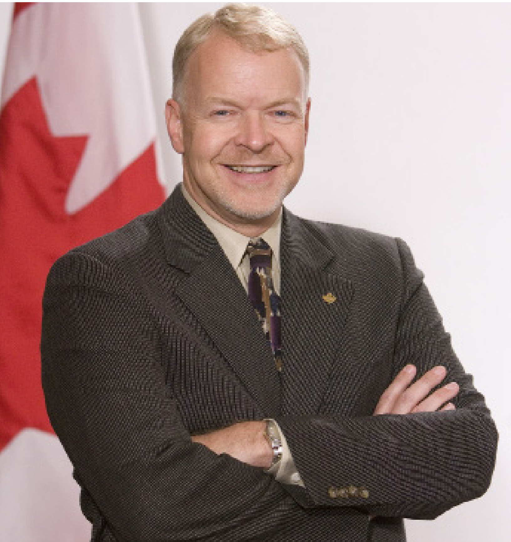
Former M.P.P. Progressive Conservative, Scarborough East 1995 – 2003