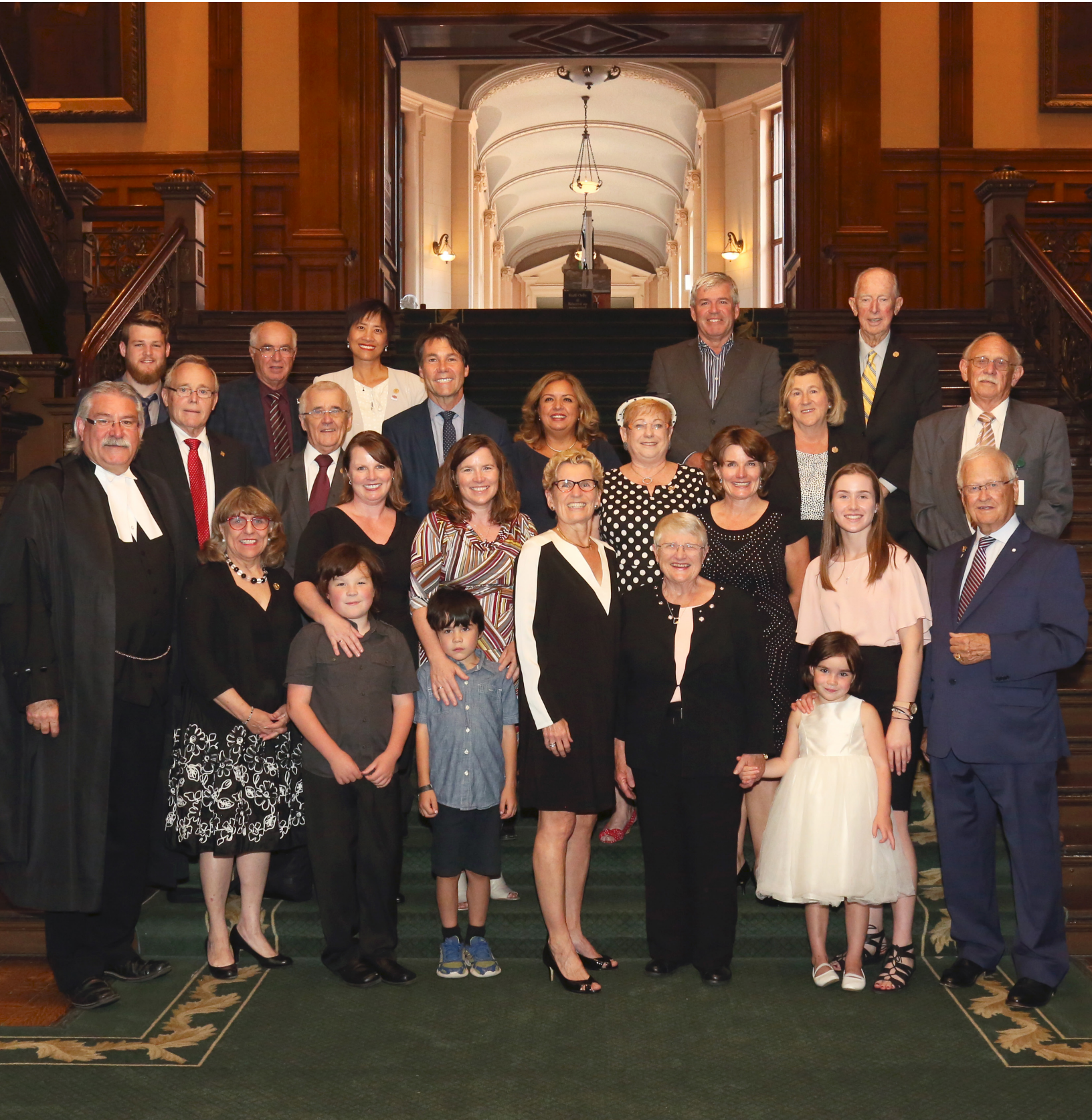
Celebrating the accomplishments and service of former M.P.P. Lyn McLeod 13