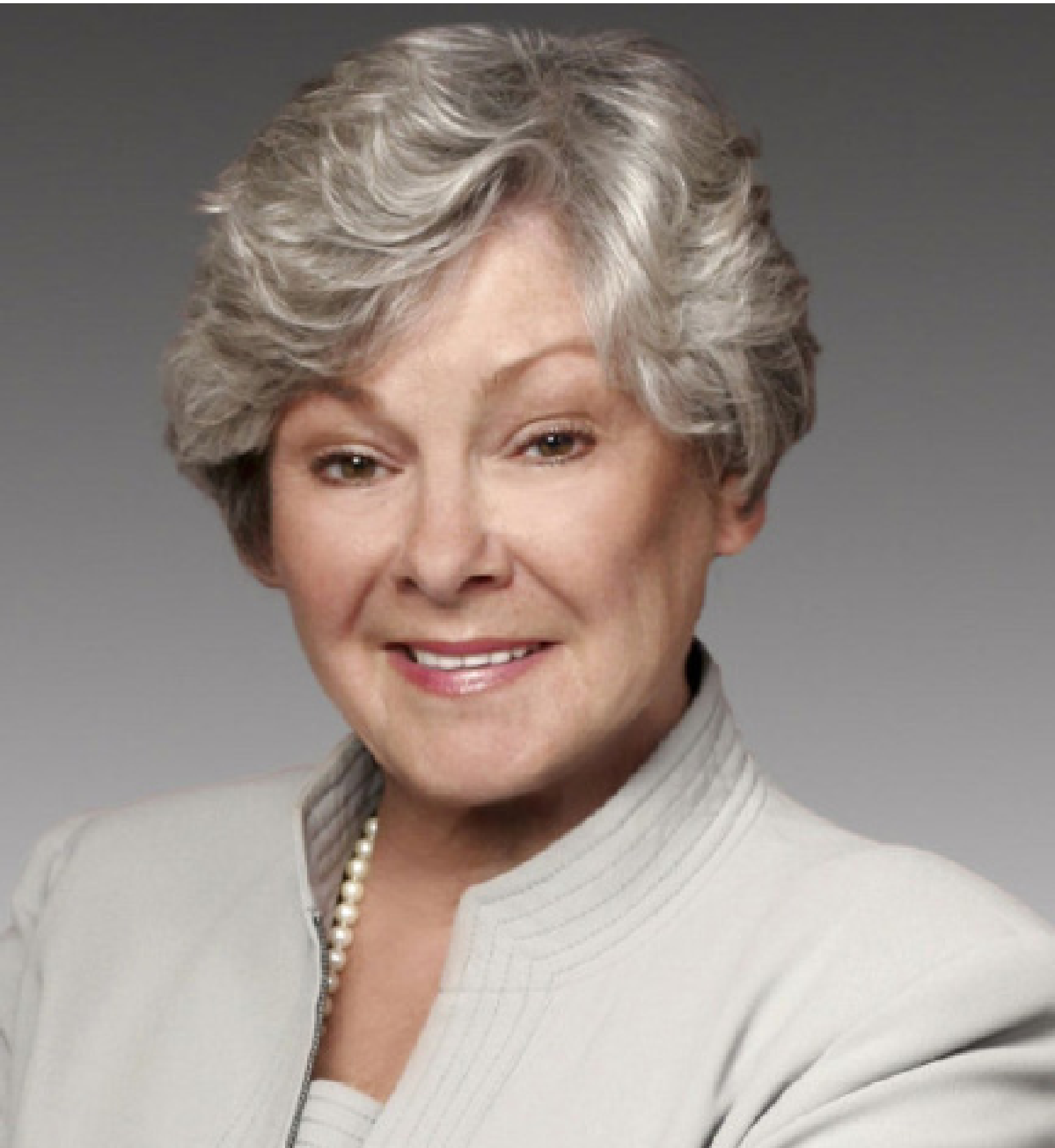
Former M.P.P. 2003-2014, Etobicoke Centre