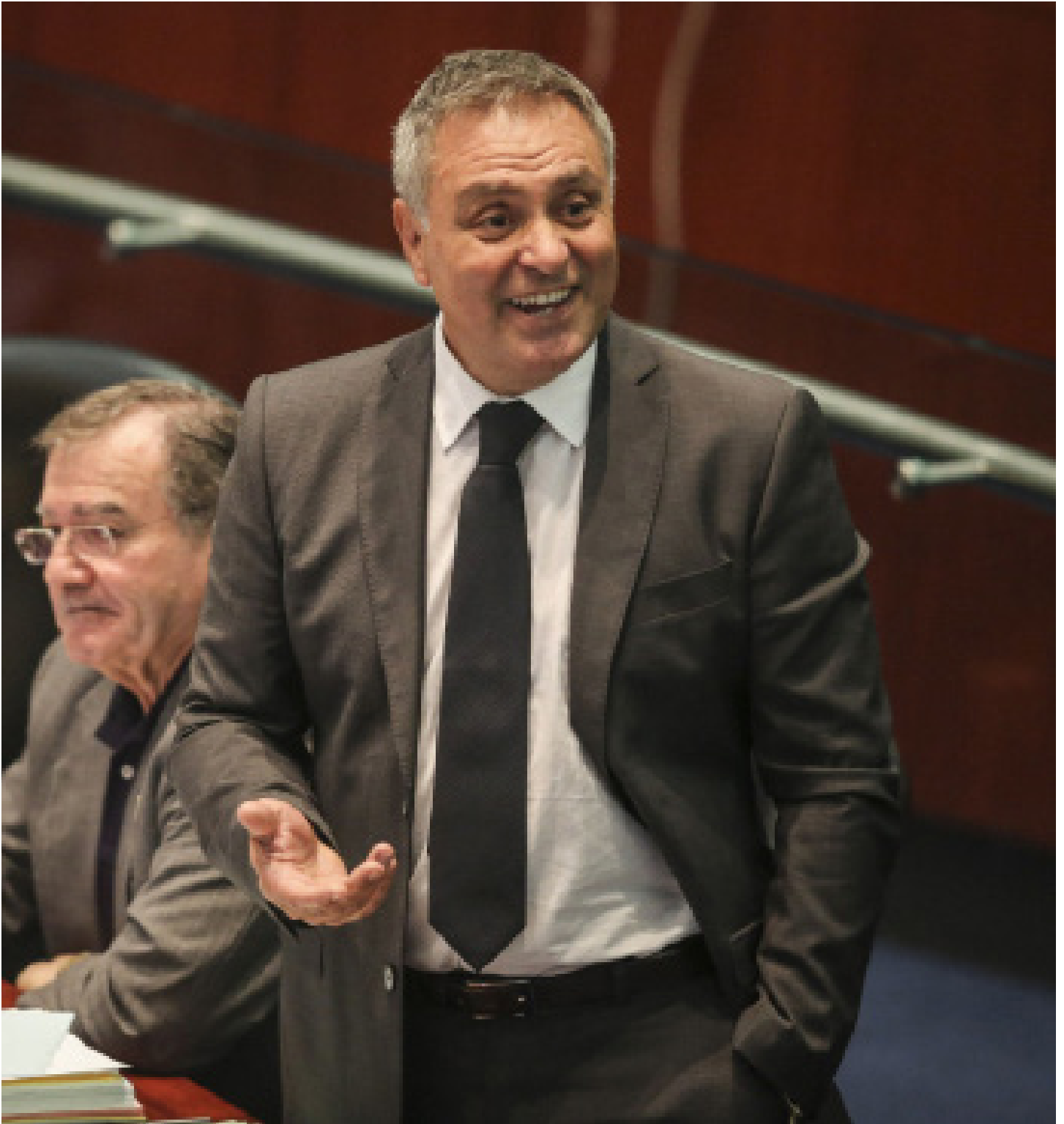
New Democrat M.P.P. Downsview 1990-1995